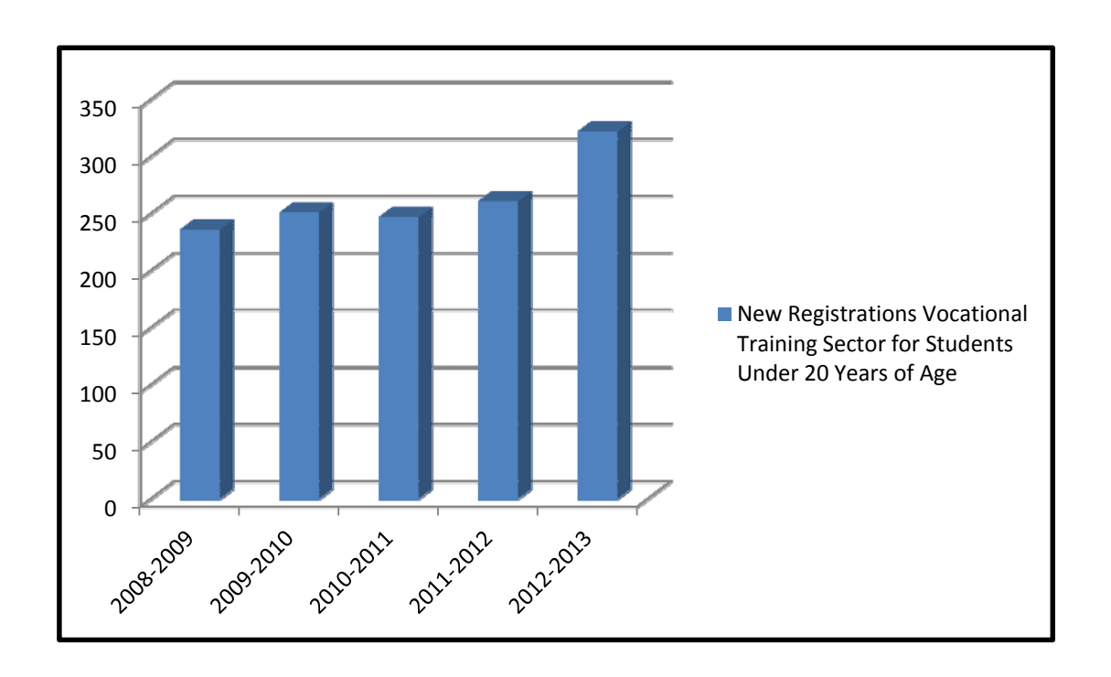
New Registrations Vocational Training Sector for Students Under 20 Years of Age

The graph below indicates that the Vocational Training sector's contribution to the overall school board graduation rate has increased over the past four years. The vast majority of these students enter without interrupting their studies and with a diploma or qualification. To continue to be successful in this area, our priority is to promote vocational training programs as viable and exciting options towards certification. We feel that by attracting more students to these programs we can improve the opportunities for success of our students.